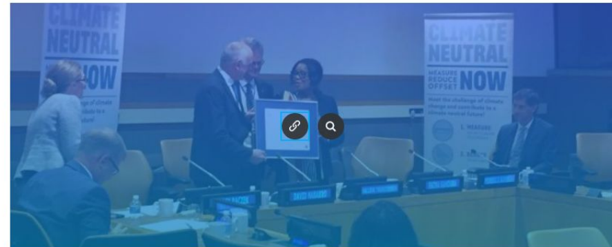
UNFCCC and FIFA join forces to combat climate change